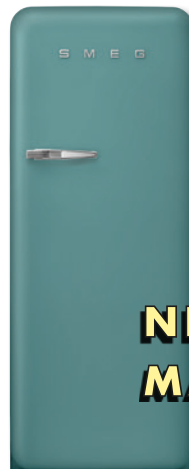
Emerald Green FAB28RDEG3