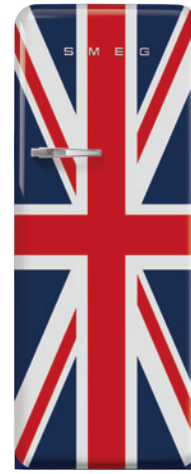
Union Jack FAB28RUJ3