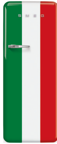
Italian flag FAB28RIT3