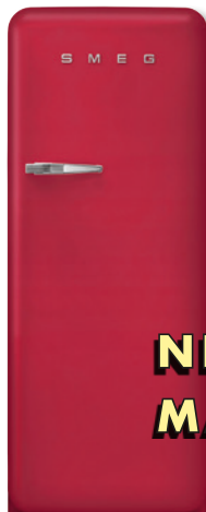
Ruby Red FAB28RDRB3