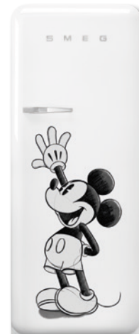
Mickey Mouse FAB28RDMM4